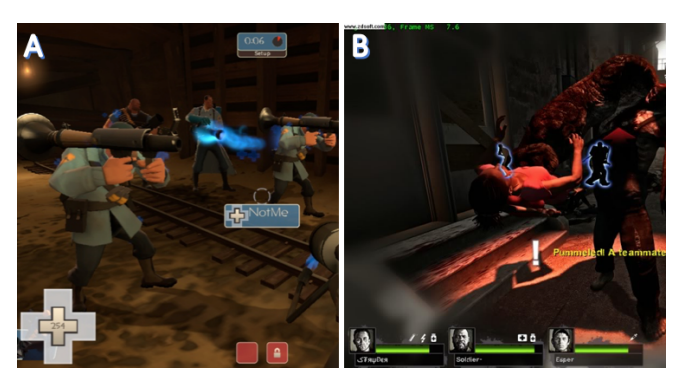
Figure 1. Two examples of WHO information (among others). A: Diegetic presence and identity information through embodiments in Team Fortress 2 [G20]. From the perspective shown, the player can tell what classes teammates are playing, what weapons they are using, and the health of the character in the crosshairs. B: X-ray vision of teammates in L4D2 [G21] demonstrates how games solve the problem of obstructed vision of teammate embodiments.

In traditional groupware systems, identity information is relatively static; while team composition may change as people come and go, individual members' names and capabilities do not. Many distributed multiplayer games are fundamentally different: although players may be continuously present, their embodiment (i.e., their in-game avatar) may go in and out of existence in the game world multiple times during a single play session as they die and respawn. Thus, WHO information is characterized both by identity of the player as well as the avatar the player embodies.