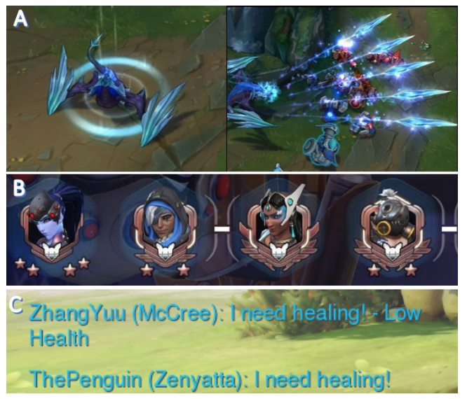
Figure 2. A: Characteristic visual effects of different embodiment actions in LoL [G17]. B: Character icons in Overwatch [G6]: the borders represent player experience whiel silver icons represent skill. C: Automatically amended chat messages in Overwatch [G6] indicating of the severity of a player's request.

There is, of course, much that can be conveyed about activity through an embodiment—for example, where an embodiment is (and where they are going) in the gameworld gives strong clues as to a player's destination and task (particularly in games that are oriented around location-based objectives); similarly, what equipment they are holding (e.g., a sniper rifle) and what they are doing with that equipment (e.g., shooting) clearly shows their current activity. In addition, many games'