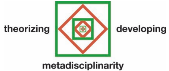
Figure 3 Theorizing and Developing. The structure of metadisciplinary connects theory and practice.

This is the model of many studies approaches, such as performance studies, which observes and writes about theater, dance, and ritual, without engaging directly in performance practice. In currently established procedures, performance studies these are not performances. This is true, in spite of the fact that a sampling of the NYU Performance Studies Department listserv indicates that many performance studies scholars are accomplished, practicing performers, and that doing performance is important to them.