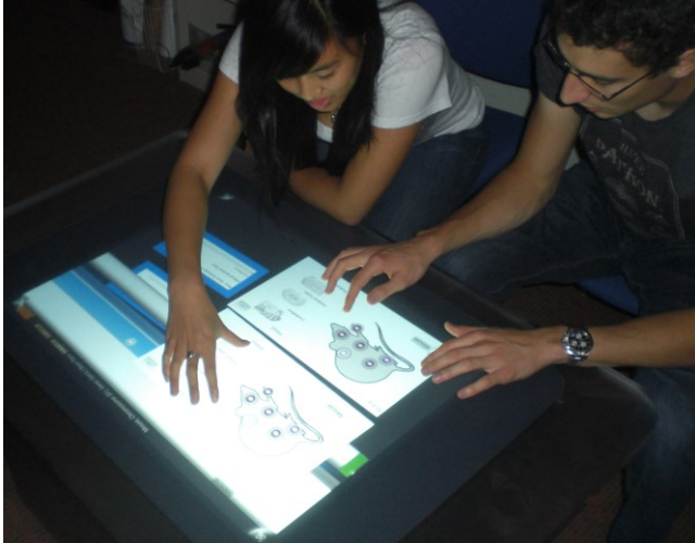
Figure 2: G-nome Surfer comparing gene ontology and expression data of different mouse genes.

provide empirical evidence for the feasibility and value of integrating reality-based creativity support environments in college-level science education as well as shed light on how users collaborate and solve problems using such environments in the context of college level inquiry-based learning [13].